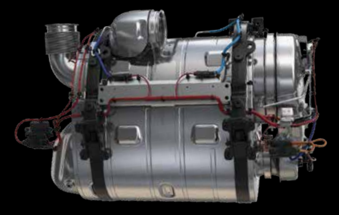
Mack Wave piston combustio efficiency